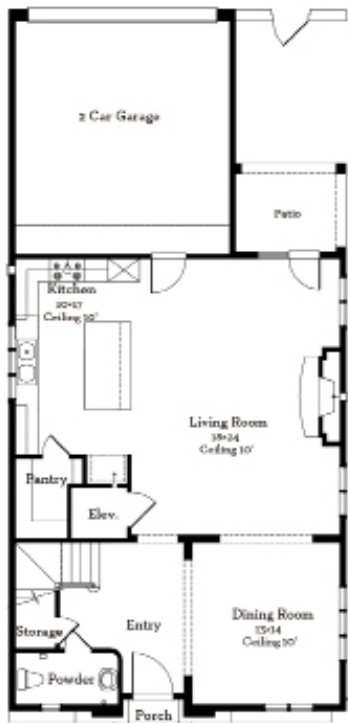
First Floor 1145 sqft