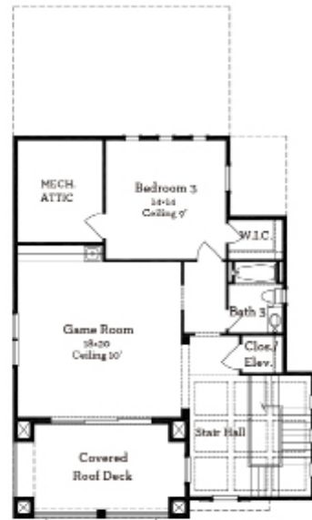
Third Floor 968 sqft

All prices, features and plans are subject to change without notice. Square footage is approximate. No representation or warranties either expressed or implied are made as to the accuracy of the information herein or with respect to the suitability, usability, feasibility, merchantability or conditions of any property herein described. Rev. 08-26-10 All Rights Reserved. ©InTown Homes 2017