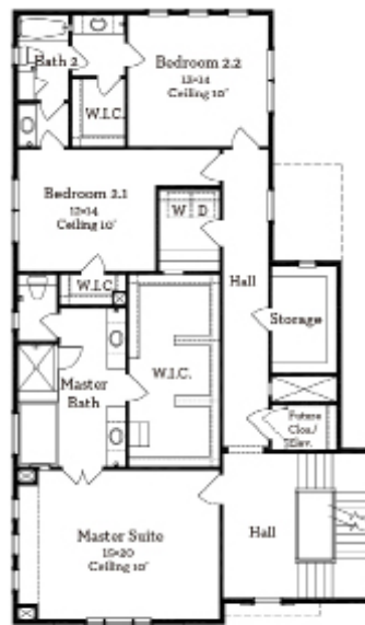
Second Floor 1818 sqft