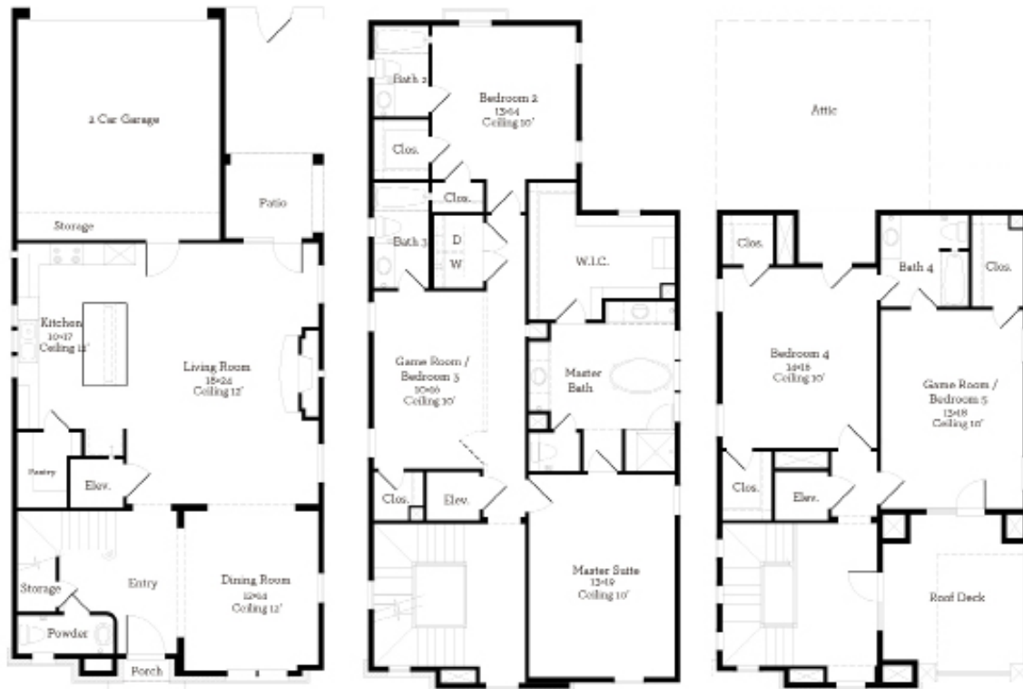
First Floor 1119 sqft