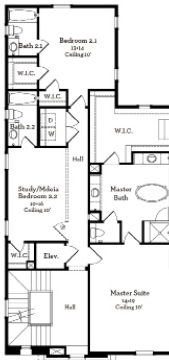
Second Floor 1630 sqft