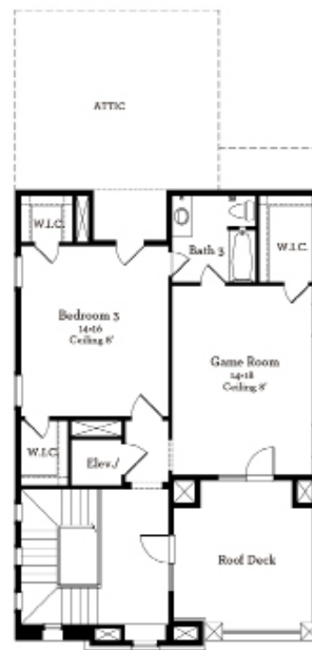
Third Floor 1154 sqft

All prices, features and plans are subject to change without notice. Square footage is approximate. No representation or warranties either expressed or implied are made as to the accuracy of the information herein or with respect to the suitability, usability, feasibility, merchantability or conditions of any property herein described. Rev. 08-26-10 All Rights Reserved. ©InTown Homes 2017