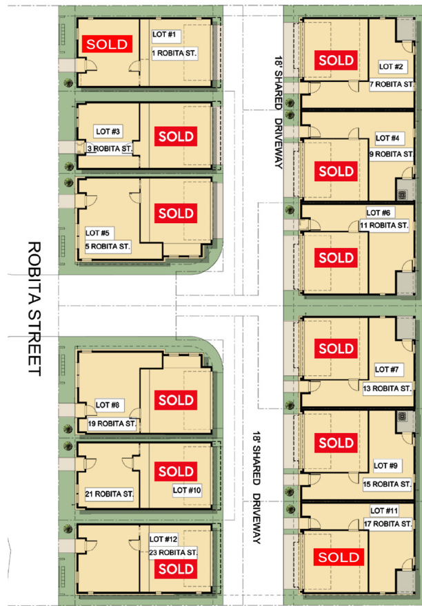
Artist rendering only. Actual colors and plans may vary significantly.